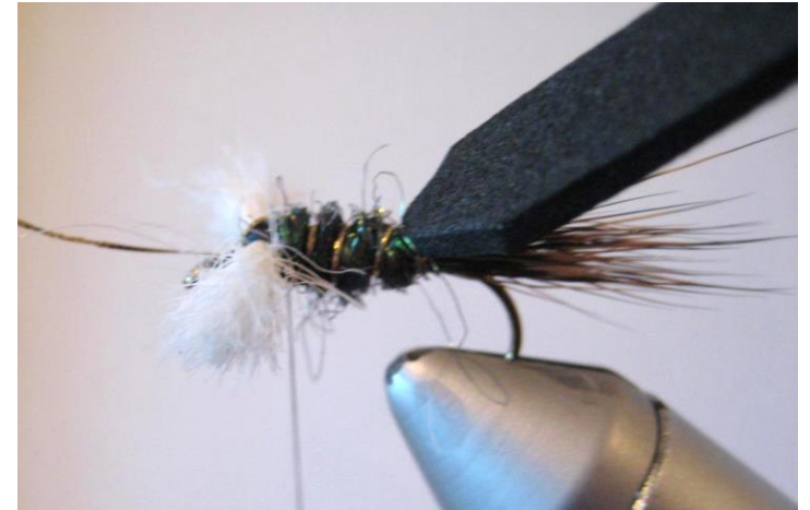
Ribbing applied to dubbed underbody. Trim off tinsel tag end.