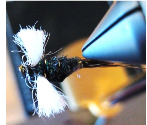
Finished fly - underside.