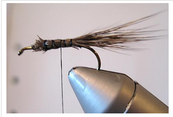
Deer hair tail tied in using early loose turns of silk to avoid flaring