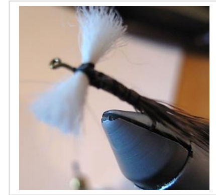
Calf tail tied in and fixed with figure of eight turns of silk

Trimmed black foam is tied in above the deer hair tail. Oval gold or silver tinsel also tied in at the base of the tail. See right: