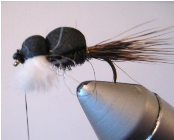
Foam brought over dubbed underbody. A few tight turns of silk are applied behind the wings to form an abdominal shape. Foam tied in just behind eye and trimmed. Whip finish and varnish.