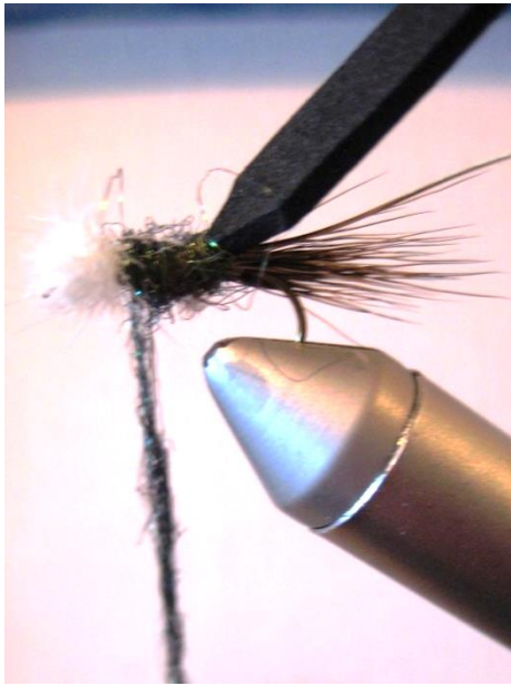
Dubbing applied and underbody wound on.